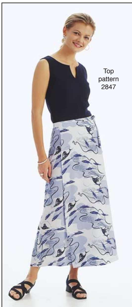
Top pattern 2847