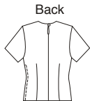
TOP VIEW A