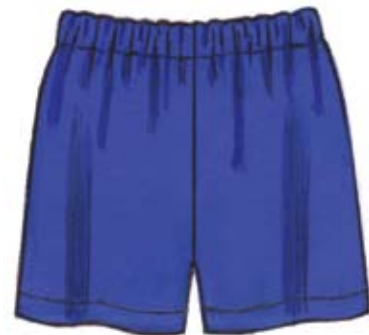
VIEW A Back